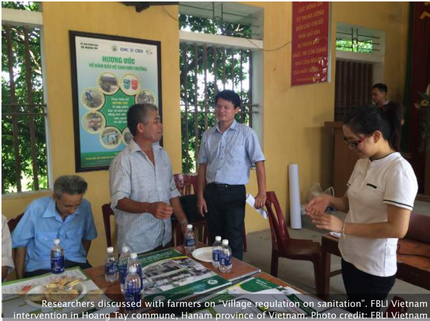
Researchers discussed with farmers on “Village regulation on sanitation”. FBLLI Vietnam intervention in Hoang Tay commune, Hanam province of Vietnam.