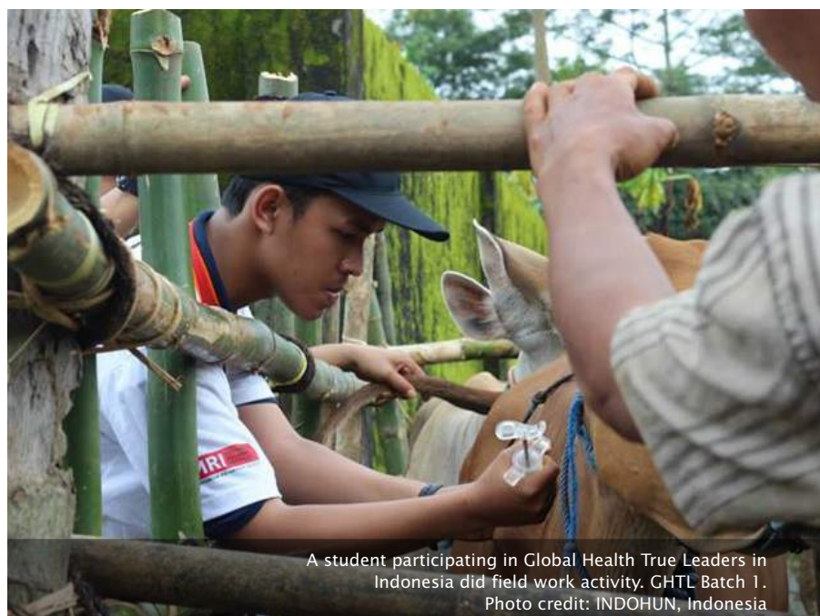
A student participating in Global Health True Leaders in Indonesia did field work activity. GHTL Batch 1.