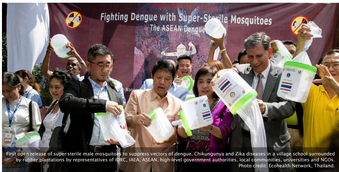
First open release of super-sterile male mosquitoes to suppress vectors of dengue, Chikungunya and Zika diseases in a village school surrounded by rubber plantations by representatives of IDRC, IAEA, ASEAN, high-level government authorities, local communities, universities and NGOs.